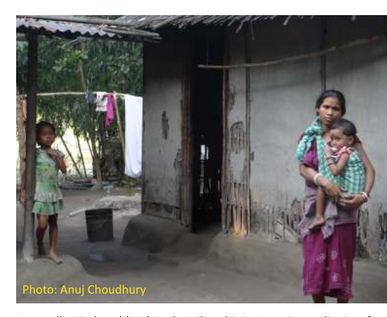
Internally Displaced (IDP) Koch-Rajbanshis in Bongaigaon district of Assam. During the height of Bodo Movement, many indigenous Koch-Rajbanshi people became victims of ethnic cleansing by certain Bodo Insurgent Groups and lost their homes