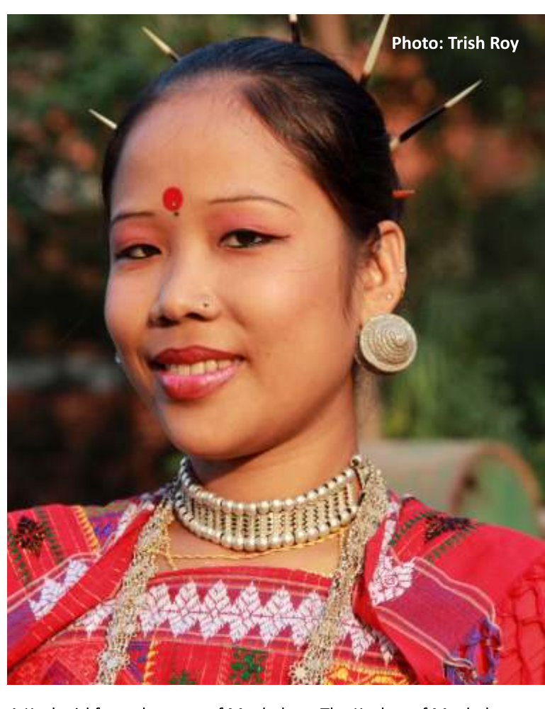
A Koch girl from the state of Meghalaya. The Koches of Meghalaya has been quite successful in retaining and preserving the ancient tradition, culture and language of the Koches in its original form.

Traditionally women have played an important and dignified role in the Koch-Rajbanshi society, whether it is in the decision making process within the community or in terms of representing the family. It should be mentioned here that traditionally Koch society is a matrilineal society in which woman is the family head. However, at present except the Koches of present state of Meghalya, large section of the Koch-Rajbanshi people of plains area follow a patriarchal system. Moreover, due to influence of other cultures, Koch-Rajbanshi women have lost their past dignified position in the society. In some instances, they have become victims of dowry. CKRSD organizes workshops and discussions to sensitize issues like dowry and other important issues related to women empowerment in various Koch-Rajbanshi areas. One such workshop was held at Dumardoh in Dhubri district of Assam in collaboration with Actionaid. CKRSD also organizes skill building workshop for woman.