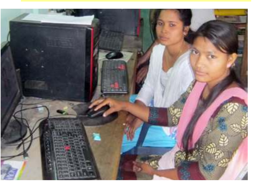
Students at CKRSD supported Axiom Computer Institute at Futkibari, Dhubri

groups. At the same time it also supports activities of other organizations time to time. CKRSD gives equal importance to both local and International organizations while collaborating. In the past CKRSD has collaborated with local Civil Society Organizations, NGOs and International organizations, like International Institute of Social History, Actionaid, Kamatapur Association, Koch-Rajbonghi Cultural Society, Consortium of Koch Royal Family's among others.