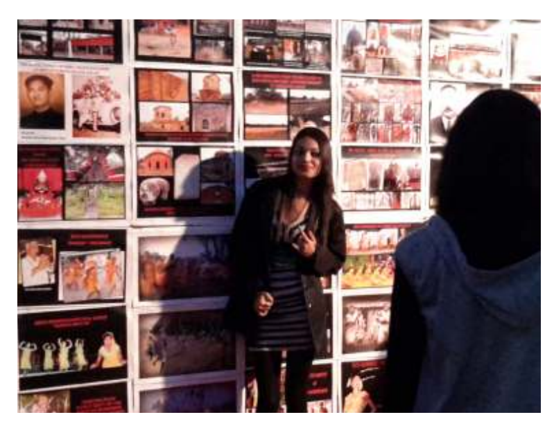
Visitors taking photos at the "Rise of the Koch Rajbanshi" program at Urban Winter Festival 2015 at Guwahati

Interviews of various scholars, writers and activists from the Koch Rajbanshi community, digitized copies of rare publications, pamphlet, memorandums, etc. A limited number of digitized documents are available for access.