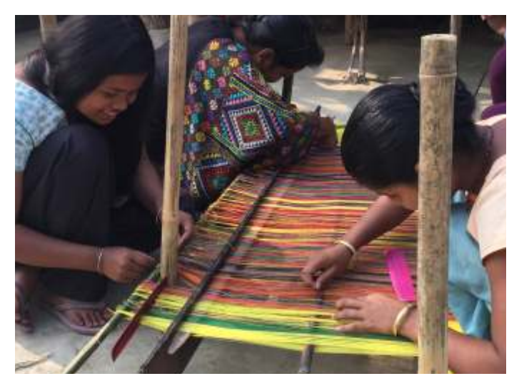
Weaving workshop on presevation of traditional Koch Design at Daisingari Village, Barpeta (Assam)